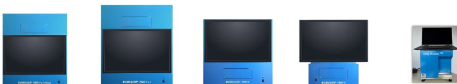
Picture 1: Bioreader® 7000, EazyReader® 7000 and Biocount® 7000 units

The Bioreader® 7000, EazyReader® 7000 and Biocount® 7000 are general laboratory instruments and they do not have to be registered as IVD medical devices because they only count objects once the assay has been completed and they are not part of the actual biochemistry of the assays. 1